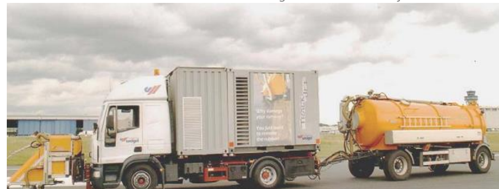
Figura 3 – Equipamento para remoção da borracha. Figure 3 – Equipment for rubber removal.

Periodo de Construção / Construction Period: Setembro 2013 / september 2013