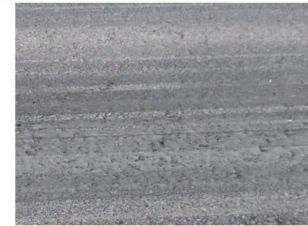
Figura 2 – Pavimento após remoção da borracha. Figure 2 – Pavement after rubber removal.